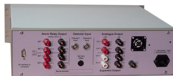
Back view of controller

The measured signal is also output in analog form as either 0-10V or 4-20mA. The controller may be connected to a computer through the digital RS232 for remote display.