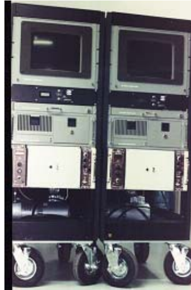
Stack analysis equipment

Tyne's flow measurements are controlled via sensitive mass flow controllers and meters; Tyne will provide calibration curves, operating and maintenance manuals, and other documentation required by the purchaser.