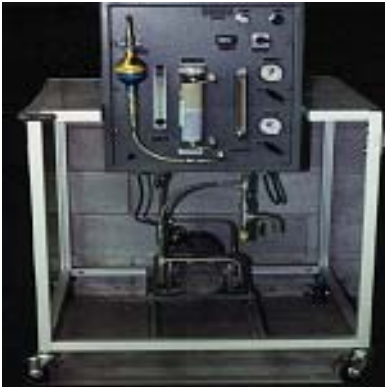
Temporary Mobile Stack monitor

Tyne will design and build to its ISO 9001-2000 program.