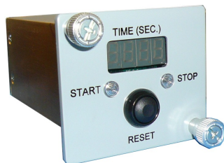
6 Removeable Modules