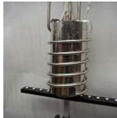
Example of a small mol sieve bed with a moisture/impurity trap

Units can be custom designed and fabricated by Tyne at the Client's request.